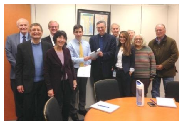
CFPA Nov. 20, 2014 meeting with Sen. Booker's Chief of Staff and Senior Foreign Policy Aide, to present petitions and advocate for the Iran Nuclear Agreement