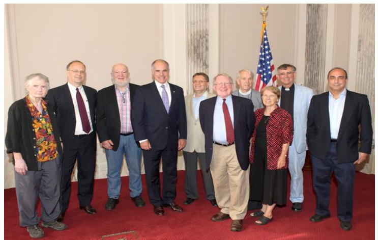
CFPA's Delegation for Iran Lobby Day to Washington, DC on July 23, 2015 meets with Sen. Bob Casey (D-PA)