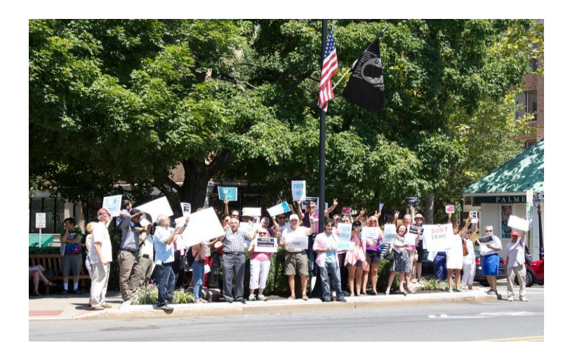
Emergency Vigil for Peace to Support the Iran Nuclear Agreement; "Global Day of Peace with Iran" August 15, 2015 Princeton, NJ