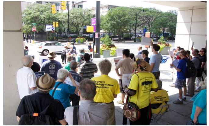
Emergency Demonstration outside of Sen. Cory Booker's Newark office urging his Support of the Iran Agreement August 29, 2015